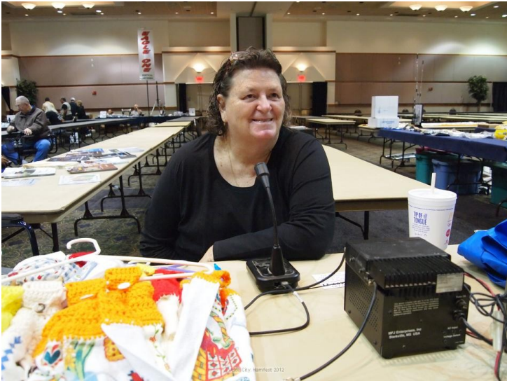
Shirlene N4JIL HF talk-in station.

I have included a few pictures, Ben W4WSM took most of the pictures, incl.those below, that will be posted on the club's web page www.kcaronline.com